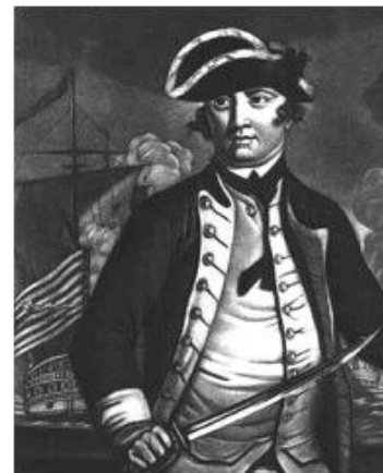
Commodore Hopkins, portrait by C. Corbutt, 1776. The 'Don't Tread on Me' flag in this image appears to be a First Navy Jack.