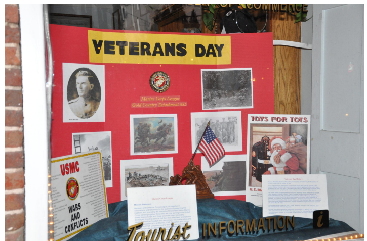
MCL Detachment 885 Nevada City Chamber of Commerce Display