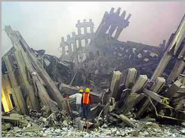
Aftermath of the twin towers

Our enemies have made the mistake that America's enemies always make. They saw liberty and thought they saw weakness. And now, they will see defeat.