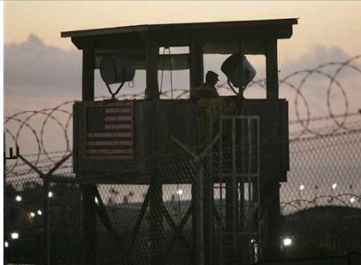
Gitmo guard tower

19 December 1972: The Marine detachment of the USS TICONDEROGA provided shipboard security for three U.S. astronauts, Eugene Cernan, Ronald Evans, Harrison Schmitt, and their Apollo-17 space capsule. The astronauts had successfully completed a (then) record lunar stay of more than 75 hours.