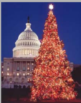
Our Nation's Capital

"He who has not Christmas in his heart will never find it under a tree."