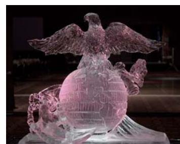
EGA Ice Sculpture at Reno, NV MC Ball